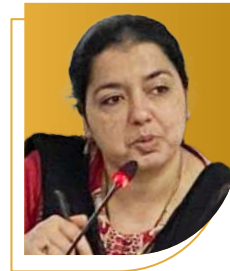
DR. ZOYA ALI RIZVI Deputy Commissioner, MoHFW, Government of India