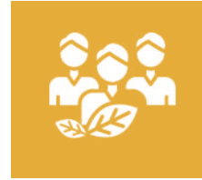
CSR Leaders & Managers