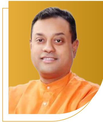
*DR. SAMBIT PATRA Member of Parliament, Lok Sabha