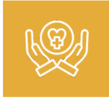
Healthcare NGOs & SHGs